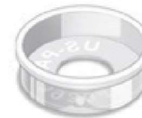
Flat bottom washer